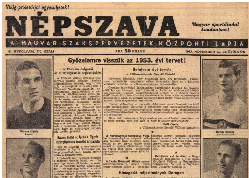
Fig 1: «We will bring the 1953 plan to victory» underneath: «The Electricity Company has completed the plan» - on both sides portraits of Hungarian footballer winning the match in England the day before, in «Népszava» (People's voice), 26 November 1953.

The communist party did not only use the players for political purposes but also the victories of the team: to demonstrate the success of the society and the country or in certain cases to promote the planned economy.